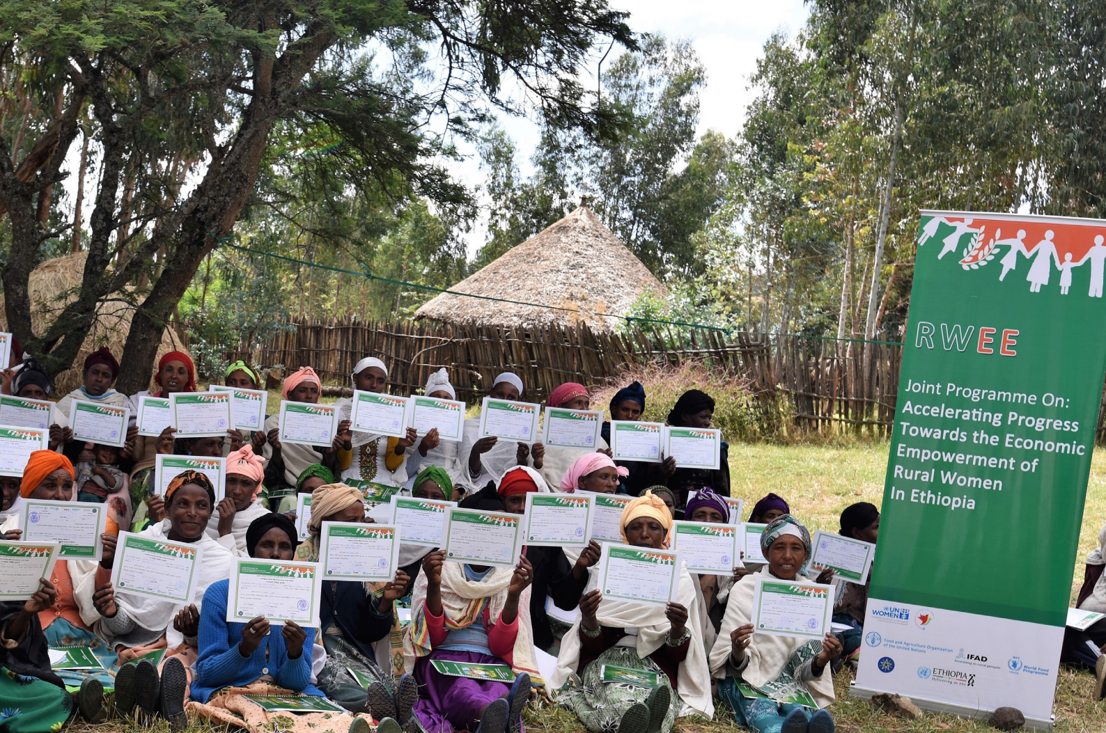
Photo: Rural women with their certificates during the graduation ceremony of a training on basic business skills in the Yaya Gulele district.