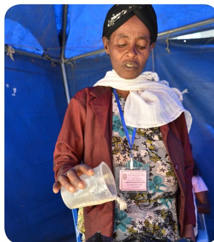
PHOTO ABOVE: A beneficiary from the Yaya Gulele district scales sunflower seeds for sale during the market linkage exhibition in Addis Ababa.

Various capacity-building trainings on how to mainstream gender and conduct gender audits have been given to rural saving and credit cooperative organizations, women associations, bureau of agriculture and livestock, bureau of women and children, bureau of education, and cooperative promotion agencies. These enabled the institutions to contribute to the diversification of the targeted women's income generation activities and to the improvement of theirs and their families livelihoods.