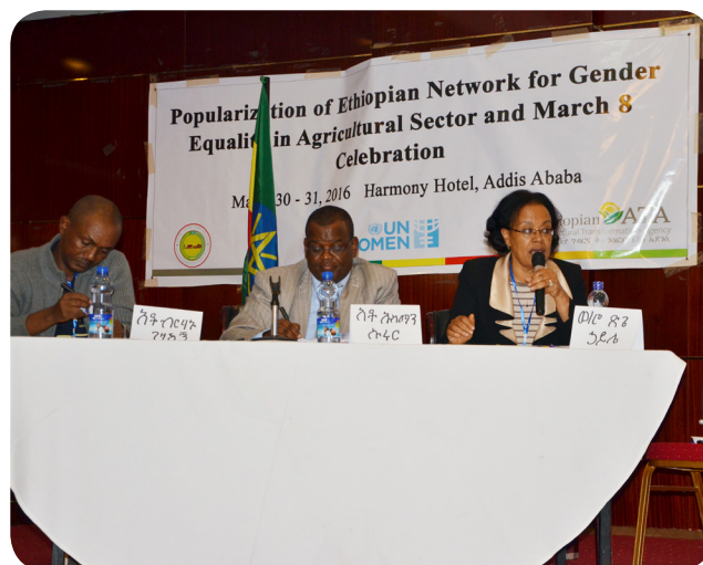
PHOTO ABOVE: A panel discussion during the establishment of the Ethiopian Network for Gender Equality in Agriculture.

ESTABLISHMENT OF THE ETHIOPIAN NETWORK FOR GENDER EQUALITY IN AGRICULTURE