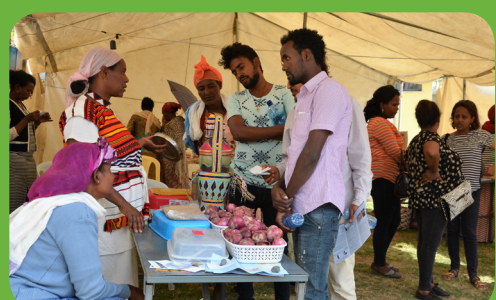
Rural Saving and Credit Cooperative Organizations' female members serve customers during a market linkage exhibition in Addis Ababa. Their participation was supported by the programme.