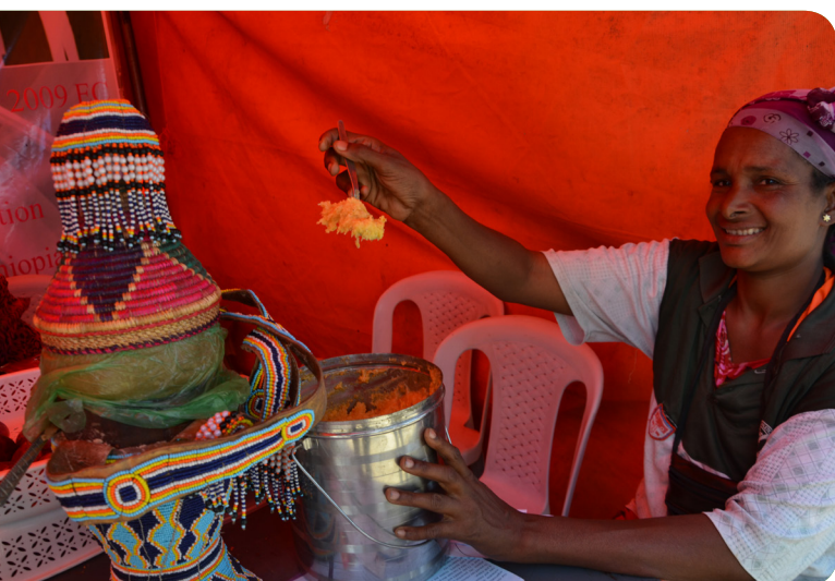
PHOTO TO THE LEFT: One of the programme's beneficiaries displays honey, which she brought from the rural area for sale during the Addis Ababa market linkage exhibition supported by the programme.