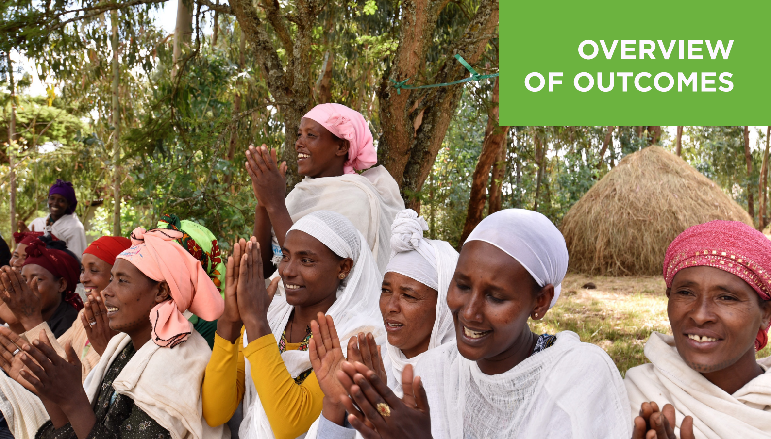
PHOTO ABOVE: Rural women celebrate their achievements during the graduation ceremony of a training on basic business skills in the Yaya Gulele district.