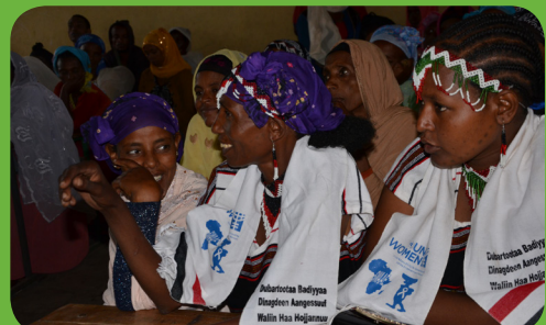
Rural women in a discussion during one of the programme's joint monitoring visits in the Adamitulu district.