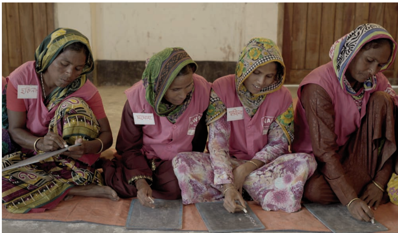
Women participating in a livelihood skills training as part of an SDG Fund joint program in Bangladesh. SDG Fund.

This program underscores the positive connections between women's inclusion, poverty reduction, and peaceful societies. It also highlights the power of SMEs to promote inclusive growth. By facilitating public-private partnerships with these enterprises (SDG 17), it is generating job opportunities that empower women, build the resilience of households, and increase economic inclusion (SDGs 5 and 8), which ultimately makes the community more inclusive and peaceful (SDG 16).