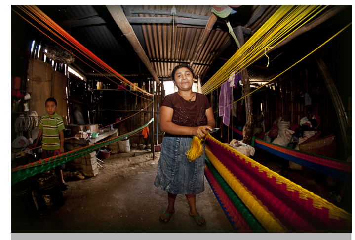
Another important initiative was the promotion of 35 entrepreneurial initiatives, which were granted with seed capital