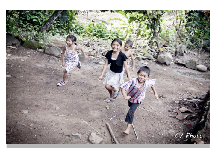
Preventing violence is possible if young people are offered alternative development opportunities

The practices promoted can serve as a point of reference for further projects on conflict prevention and peacebuilding carried out in El Salvador, and are also applicable to other countries.